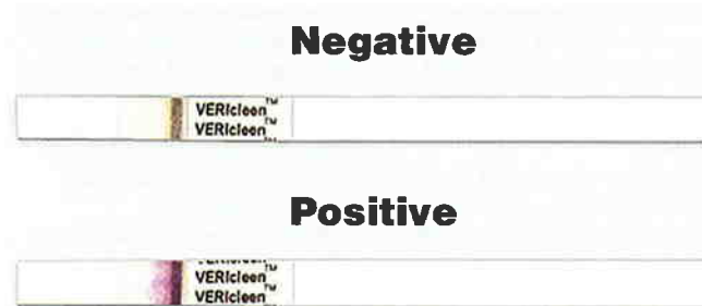
The VERicleen food residue surface test.

Food residues that are allowed to accumulate can act as continuous contamination sources in which micro-organisms can reside